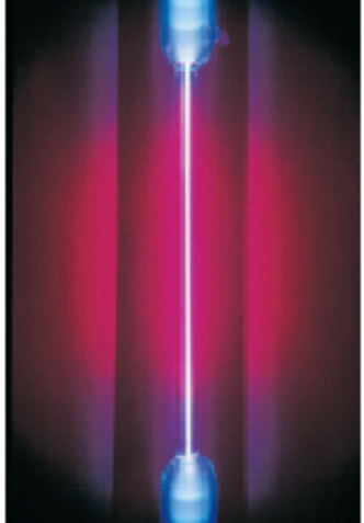
Figure 3: Spectroscope